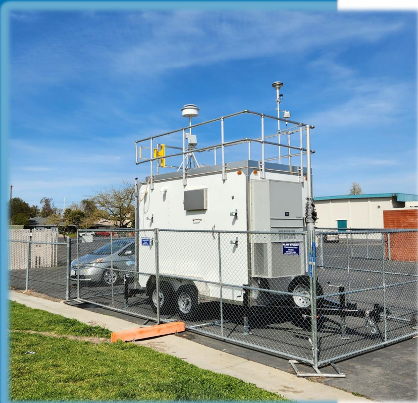
Portable Lab Debut: April 29, 2023